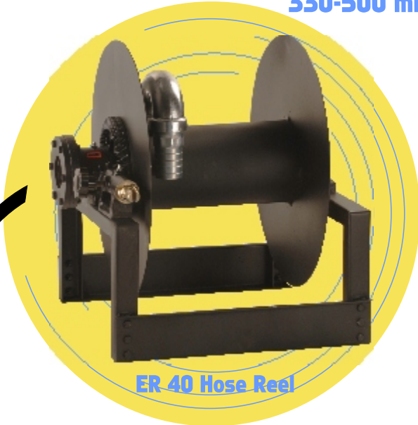
ER 40 Hose Reel